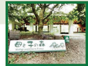
Mother and Child Forest Listen to birdsong to your heart's content in a grassy clearing beside a forest pond.

Best for Ages 0 to 15 Best in Spring and fall