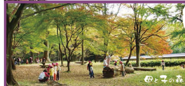
Mother and Child Forest Learn about the seasonal variation of insect, bird, and plant species in nature guidebooks, or simply relax and read books from the forest library.

Best for Ages 3 to 12 Best in Spring and fall