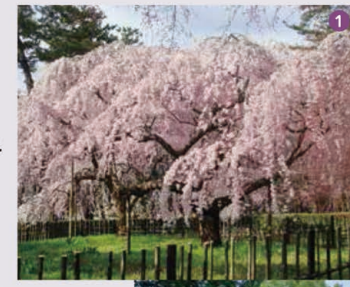
1 [A weeping cherry tree at the site of the former Konoe-tei Residence] This area in the northwestern part of the Gyoen belonged to one of Kyoto's Five Regent Families (go-sekke). Around 60 weeping cherries mark the site of the former residence of the Konoe family, many of whom served in important positions as regents (sessho) and chancellors (kanpaku).

A nearly rectangular national park surrounding Kyoto's Imperial Palace, Kyoto Gyoen spans about 700 meters east to west and 1,300 meters north to south. The area is closed to public traffic, making it an appealingly child-friendly environment. Visit the Mother and Child Forest, with its library of nature guide books, and gaze at the fresh greenery of the Japanese maples in spring or enjoy playing in fallen leaves in autumn. See the weeping cherry blossoms at the site of the former Konoe-tei Residence, then visit the nearby Children's Playground, which has swing sets and slides and is a fun spot to play.