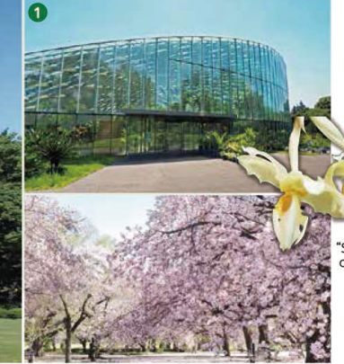
"Stanhopea Shinjuku" orchids

1 [Greenhouse] Standing prominently at the end of an expanse of lawn, the large glass building of the Garden's greenhouse is filled with many rare varieties of tropical plants.