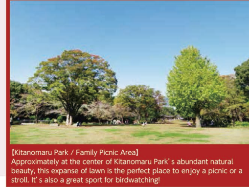
[Kitanomaru Park / Family Picnic Area] Approximately at the center of Kitanomaru Park's abundant natural beauty, this expanse of lawn is the perfect place to enjoy a picnic or a stroll. It's also a great sport for birdwatching!

2 [Wadakura Rest House] On the east side of Wadakura Fountain Park, this free rest house provides a sheltered space to eat and drink. From inside you can watch the water features and fountains or take in an exhibit about the Imperial Family and the Palace.